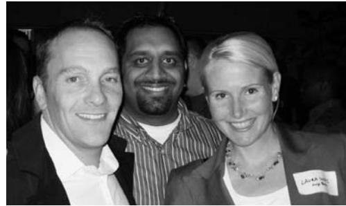
Amicus Mixers draw attorneys from Valley firms for informal networking and support of SVCLS.